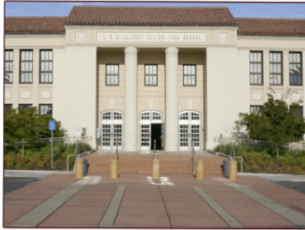
McClatchy High's entrance as it looks today